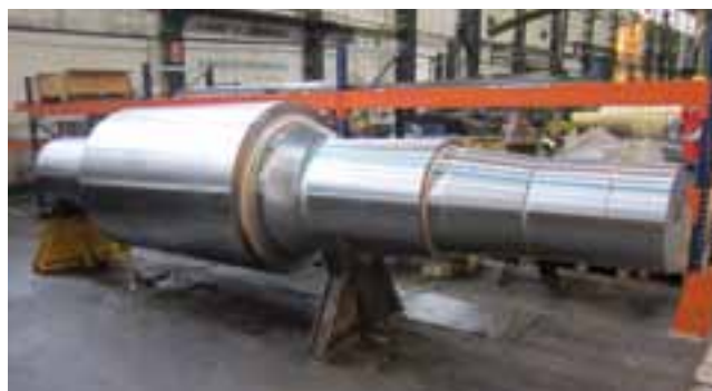
Roller press shaft