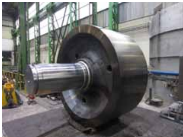
Assembly of roller & roller shaft