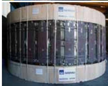
Kiln tire ring