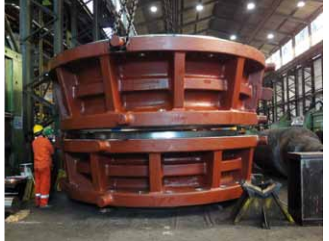
Gyratory crusher (stack test)