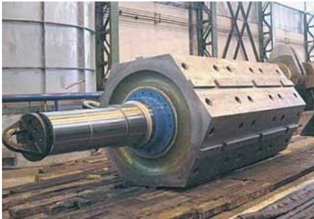
Roll crusher with shrunken shaft (oil sands)