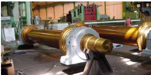
Apron feeder shaft