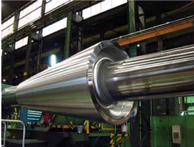
Main shaft gyratory crusher