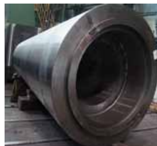
Mantle head core shaft