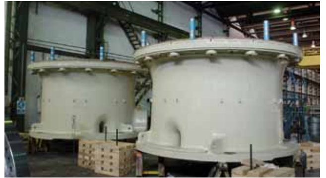
Main frame secondary crusher